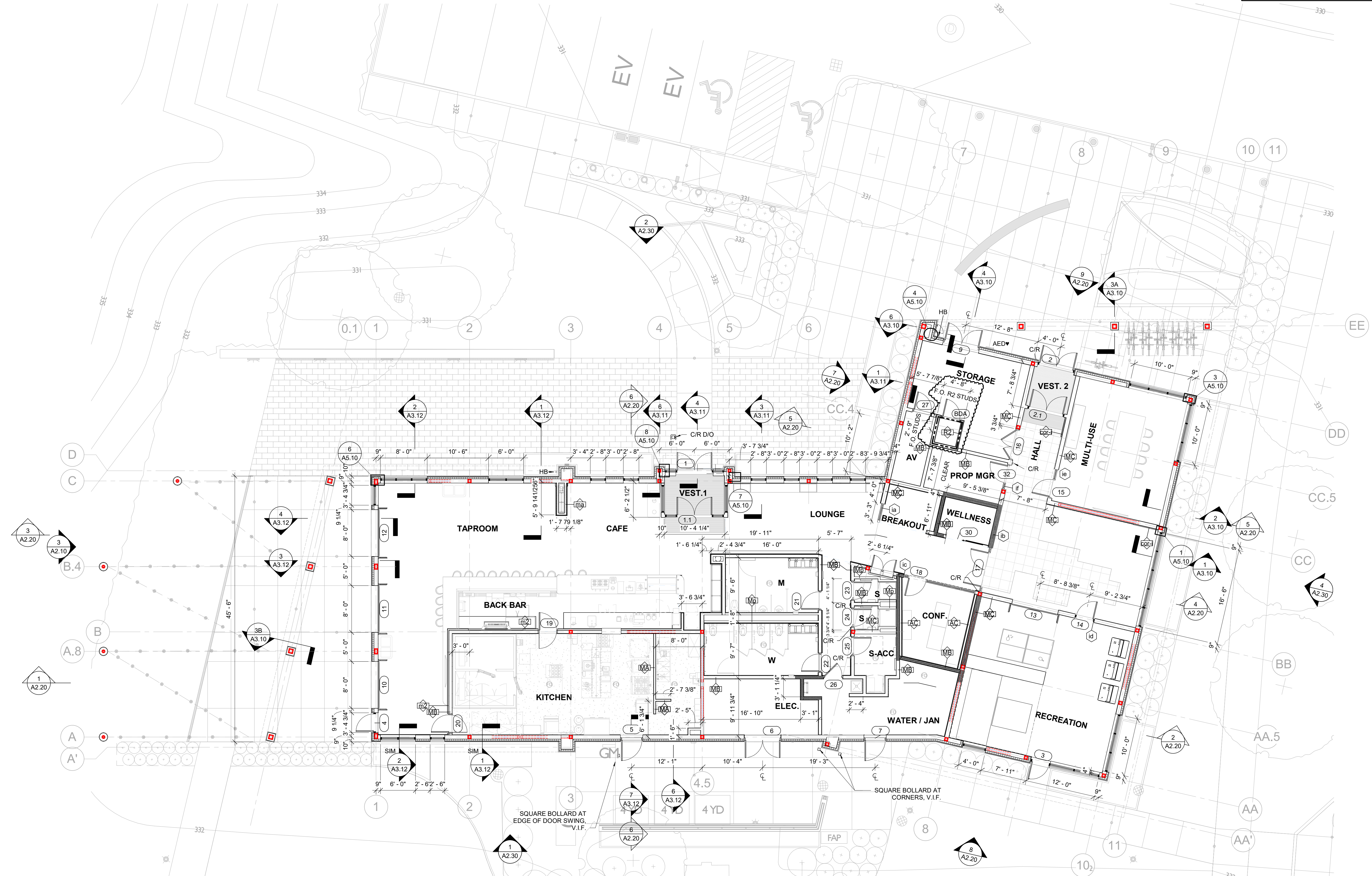
1 GROUND FLOOR SCALE: 1/8" = 1'-0"